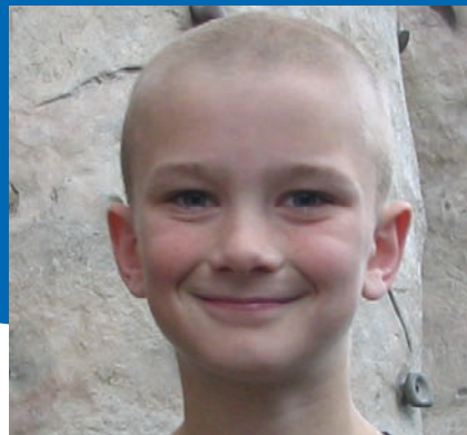
Gary wished to meet the crew of The Deadliest Catch .